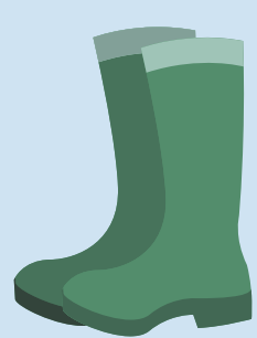
rain boots or winter boots