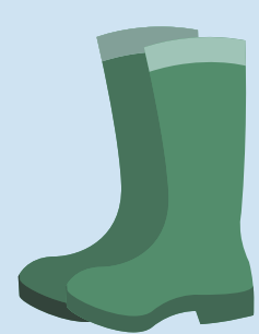
rain boots or winter boots