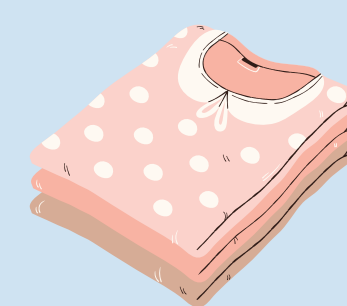
extra clothing including socks