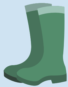
rain boots or winter boots