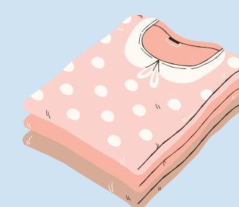
extra clothing including socks