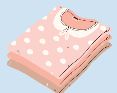
extra clothing including socks