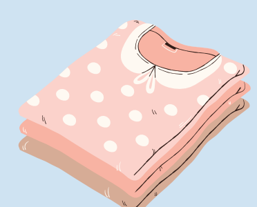
extra clothing including socks