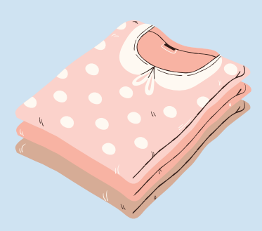
extra clothing including socks